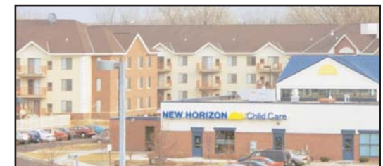
Below, the site includes the New Horizon Child Care Center and the Dakota Station Apartments.