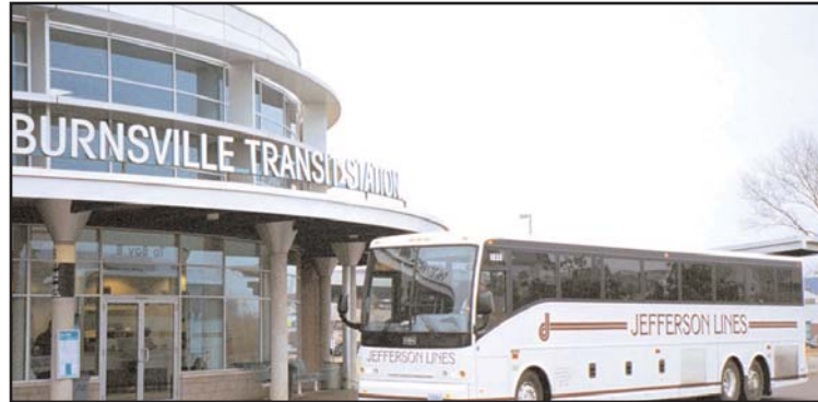
Jefferson Lines buses stop at the Burnsville Transit Station on three southbound and two northbound trips daily, to such destinations as Dallas, Kansas City and more.