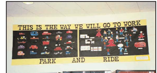
Students from Hidden Valley Elementary School in Savage produced artwork (above) that was recently displayed at the Transit Station. The focus of the artwork was alternatives to driving alone in celebration of Earth Day.