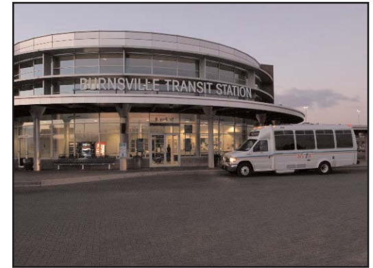
Nearly 150 buses operate through the Burnsville Transit Station on a daily basis to destinations throughout the Twin Cities and the MVTA service area. The site also serves as a connection point for Scott County Dial-a-Ride, Metro Mobility and DARTS buses. Jefferson Lines buses also use the Burnsville Transit Station as a depot.