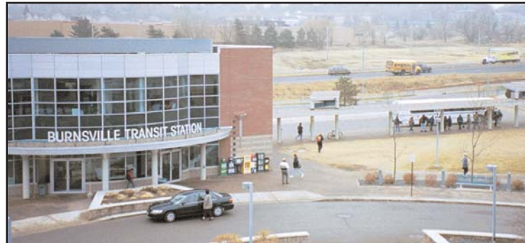
In addition to the some 1,300 parking spaces at the Burnsville Transit Station including the parking deck (below), many riders are dropped off to catch buses to destinations including downtown Minneapolis, downtown St. Paul, the University of Minnesota, Mall or America and Burnsville Center.